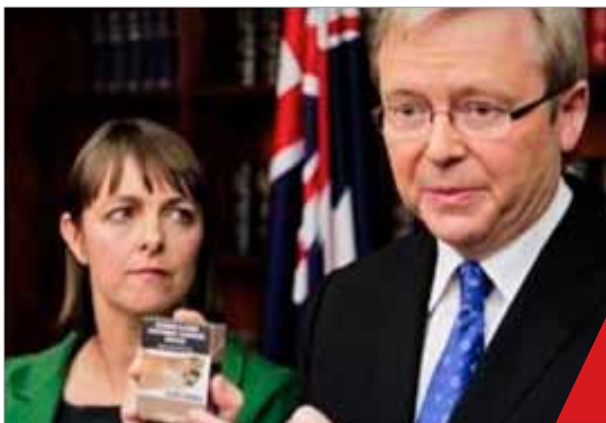
Health Minister Nicola Roxon and then Prime Minister Kevin Rudd announce the decision, 29/4/10

In 2009 mandatory plain packaging of tobacco was recommended by the Australian Government's National Preventative Health Taskforce. 123 On April 29, 2010, the Australian government announced 124 that plain packaging of tobacco products would be mandatory, commencing in January 2012, to reach full implementation by July 1, 2012. Australia was the first country in the world to set such a deadline. Health groups hailed the decision as a major step in the fight against tobacco. 125