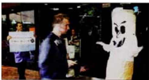
Illawarra Mercury report, 6 April 2004

Today, students will be able to talk to organisations from across the region at the Illawarra Graduate Careers Fair.