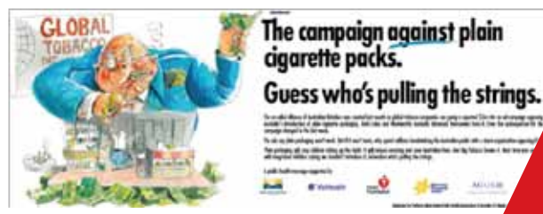
Health groups' counter-ad in Australian press, August 2010

The AAR campaign split the retailer groups, with major supermarkets Coles and Woolworths repudiating the campaign and the Australian Association of Convenience Stores withdrawing from it. Meanwhile health groups launched a counter-campaign under the banner "Guess who's pulling the strings?" 133