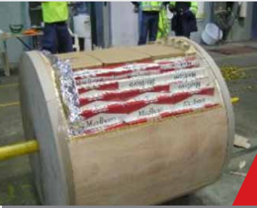
Illicit tobacco haul

The TI has repeatedly raised illicit trade as an argument against tobacco reduction measures – including tax increases, retail display bans, and mandatory plain packaging. These arguments routinely seek common ground with government concerns by exaggerating the level of illicit tobacco trade in Australia. They also distract from expert recommendations for improved enforcement to reduce illicit trade.