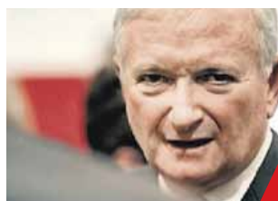
tobacco control laws.