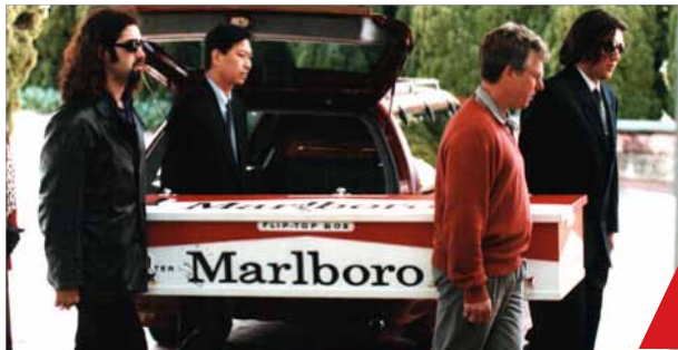
Funeral of Adam’s Dad

Despite its best image-polishing efforts, the TI was rated least reputable among the world’s 25 major industry categories in a Global Reputation Pulse independent survey in 2010 of over 80,000 consumer interviews in 32 countries. 16