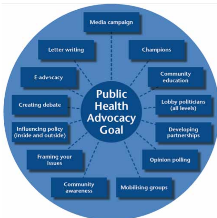
Combination of advocacy strategies from Advocacy in Action 113