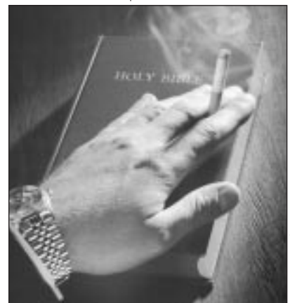
Cancer Foundation WA

An information bulletin for MPs from Australia’s leading health organisations: