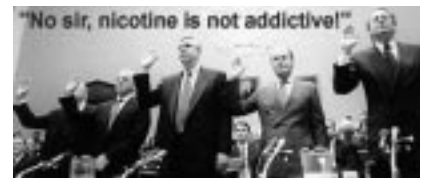
Tobacco chiefs to US House of Reps Energy and Commerce Committee hearings, 1994